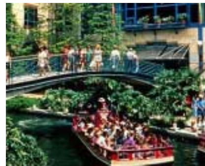
Magnets for convention-goers, the San Antonio River and its River Walk lead visitors to the convention site, restaurants, hotels, and shops.

For the first time, the International Institute will be open to all Rotarians attending the convention. The International Institute will give